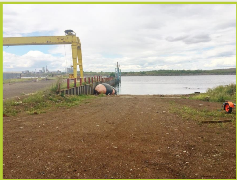
Former Aveco premises, The Slipways, Dockside Road, Middlesbrough, TS3 8AT