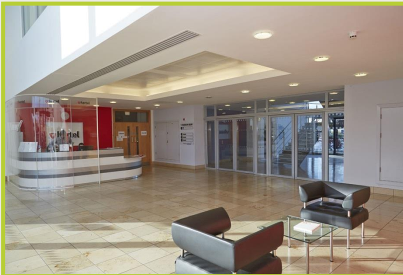
Ground Floor West Hudson Quay, Middlehaven, Middlesbrough, TS3 6RT